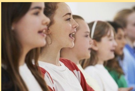
Hoolies Youth Choir