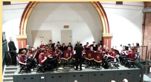
Northumberland Youth Ensemble