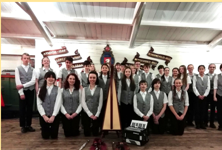
The Northumbrian Ranters Traditional Music Ensemble