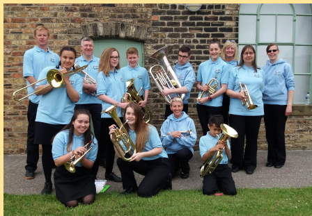
Bedlington Brass Community Band