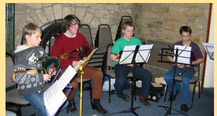
The Young Pipers Group Northumbrian Pipe ensemble