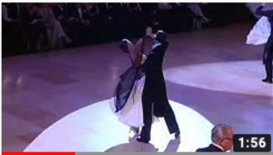
Blackpool 2010 Ballroom Dancing Pro Final - Tango

https://www.youtube.com/watch?v=DDctYRY3LQY&t=32s