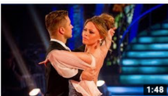
Kimberley Walsh & Pasha Viennese Waltz to 'A Thousand Years' - Strictly Come Dancing 2012 - BBC One

https://www.youtube.com/watch?v=WUOhwz8VrV0