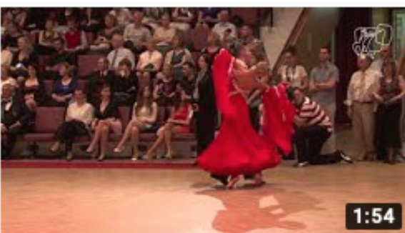
The Final Viennese Waltz | 2013 European Tea Dance

https://www.youtube.com/watch?v=WUOhwz8VrV0