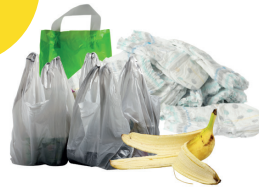
Nappies, food and animal waste, bags