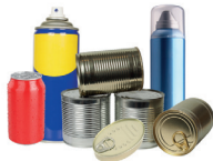
Tins, cans & aerosols