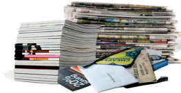
Junk mail, newspapers, catalogues

Place clean, dry & loose (not bagged) in your recycling bin.