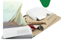
Paper, card & cardboard