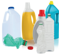
ANY plastic bottles & their lids (Including milk bottles)