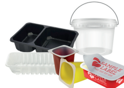
Any plastics which aren't bottles