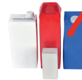
Tetra Paks (paper based juice & milk cartons)*