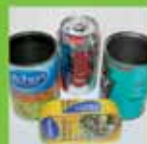
Food & Drink Cans