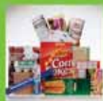
Paper & Card

YES PLEASE: These things CAN be recycled - just stick them in your recycling bin