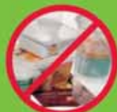
Yoghurt pots & meat trays

NO THANKS: These things can't be recycled - stick them in your rubbish bin