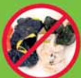
Sacks & carrier bags