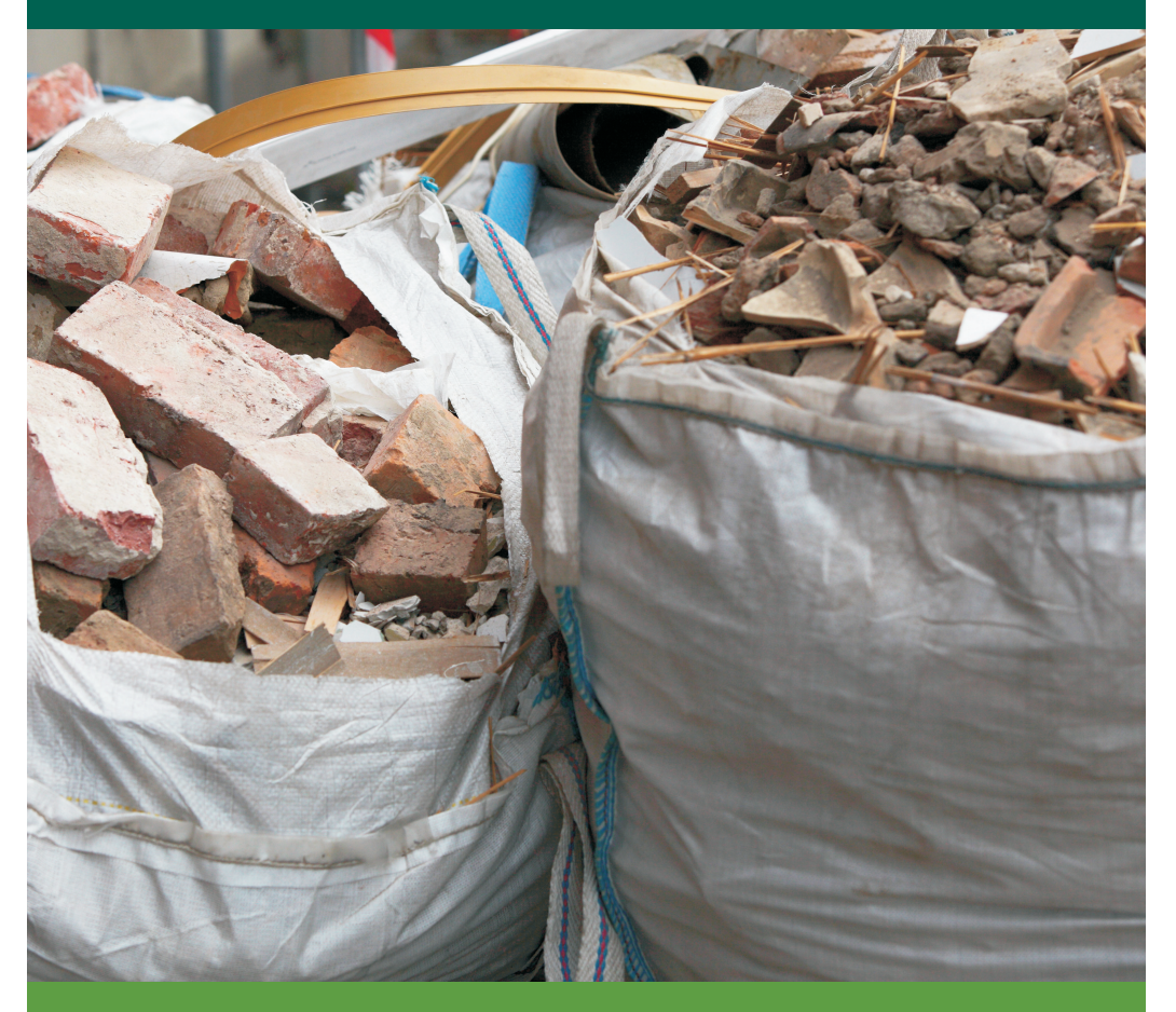
From 1st February 2024 all vehicles delivering DIY waste will require a permit in advance of arriving on site. See inside for more details.

'Pay as you Throw' charges will continue to apply for all DIY waste volumes above the 'free' limits.