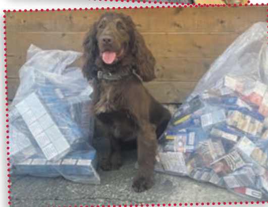
Above: Yoyo and Harley are specially trained tobacco detection dogs who work with the team sniffing out black-market tobacco