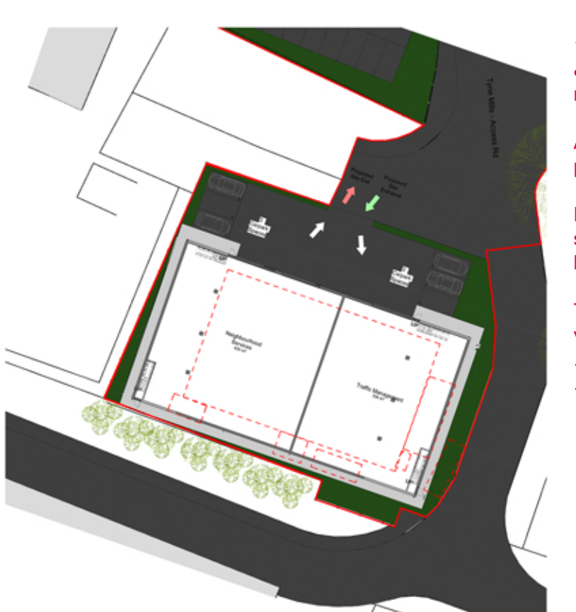
Proposed Shed - Site Location Plan