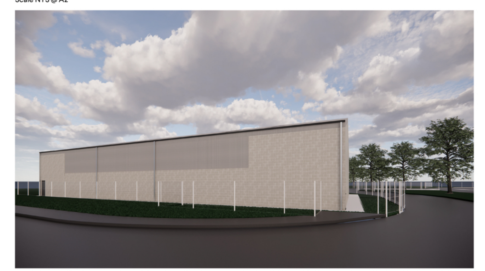
Proposed Shed - View from South East Scale NTS @ A2