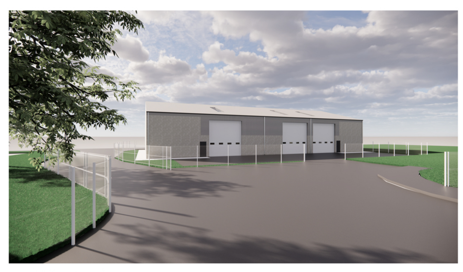
Proposed Shed - View from North East Scale NTS @ A2