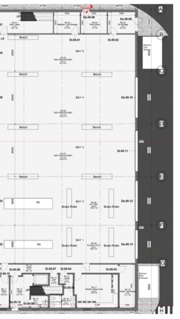
Proposed Garage - Ground Floor Plan