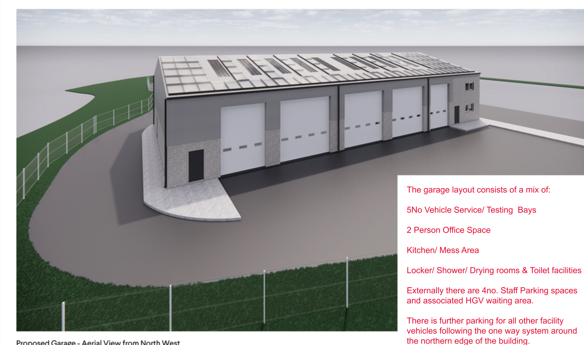
Proposed Garage - Aerial View from North West Scale NTS @ A2