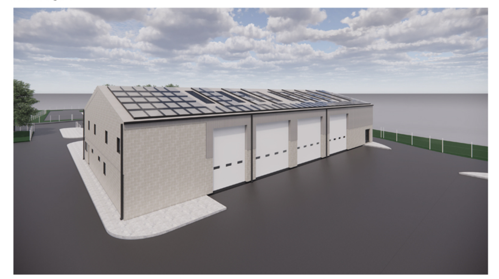
Proposed Garage - Aerial View from South East Scale NTS @ A2