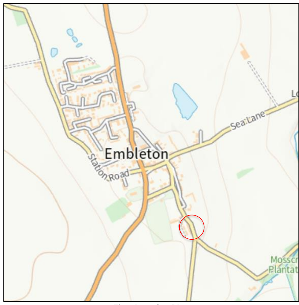
Fig.1 Location Plan

Sunny Brae is a short row of twelve houses located on the west side of the C74 road in Embleton. The road leads to the cost and other attractions in the area, in is also part of National Cycle Route 1 (Coast & Castles). The location is shown in Figure 1, below.