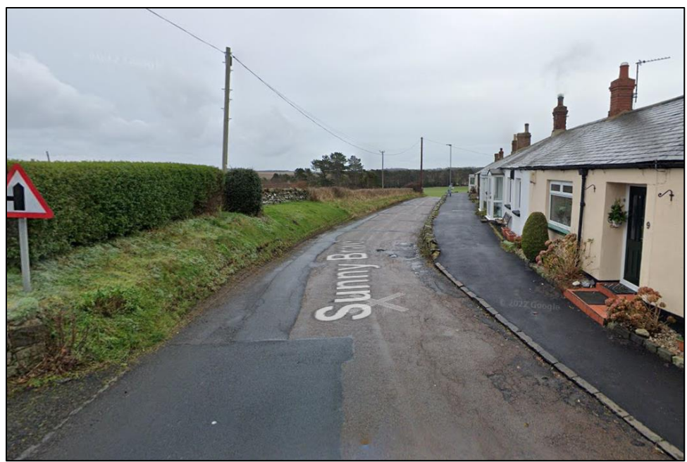
Fig.2. Sunny Brae looking south.

5. There is a raised footway area immediately adjacent to the properties, part of which is wide enough to accommodate vehicles and is sometimes subject to parking.