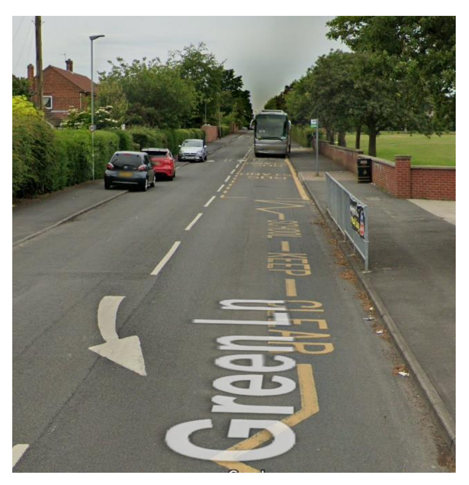
Fig. 1: Existing parking restrictions outside Ashington Academy

The route is used by school transport as the pick-up and drop-off point for buses and is regularly congested with parked vehicles during school start and end times. The only parking restrictions currently in place are 'School Keep Clear' zig-zag markings directly outside the entrance gates and a Bus Stand which has been marked to allow school transport vehicles to wait and manoeuvre without vehicles causing obstructions.