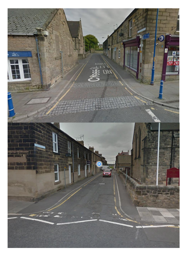
Google images of Cross Street

Residents have reported that there have been a number of "near misses" involving both vehicles and pedestrians. The council has therefore proposed that a one-way system be considered in order to improve road safety in the area.