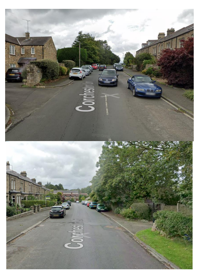
Google images of Corchester Lane

It was proposed that 'No Waiting at Any Time' parking restrictions be considered in order to improve road safety in the area.