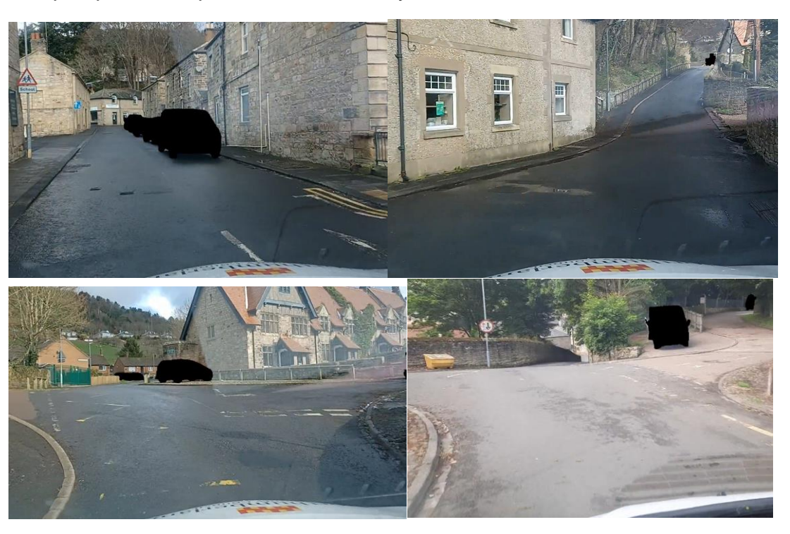
Vaisala images of Brewery Lane

The 'No Waiting at Any Time' parking restrictions will be incorporated into the 20mph speed limit planned for Rothbury First School.