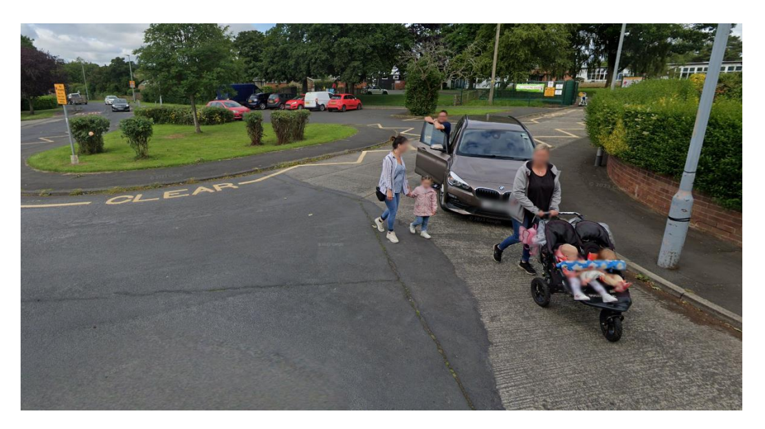
Fig. 2: Example of parking on the corner of Abbots Way, Morpeth