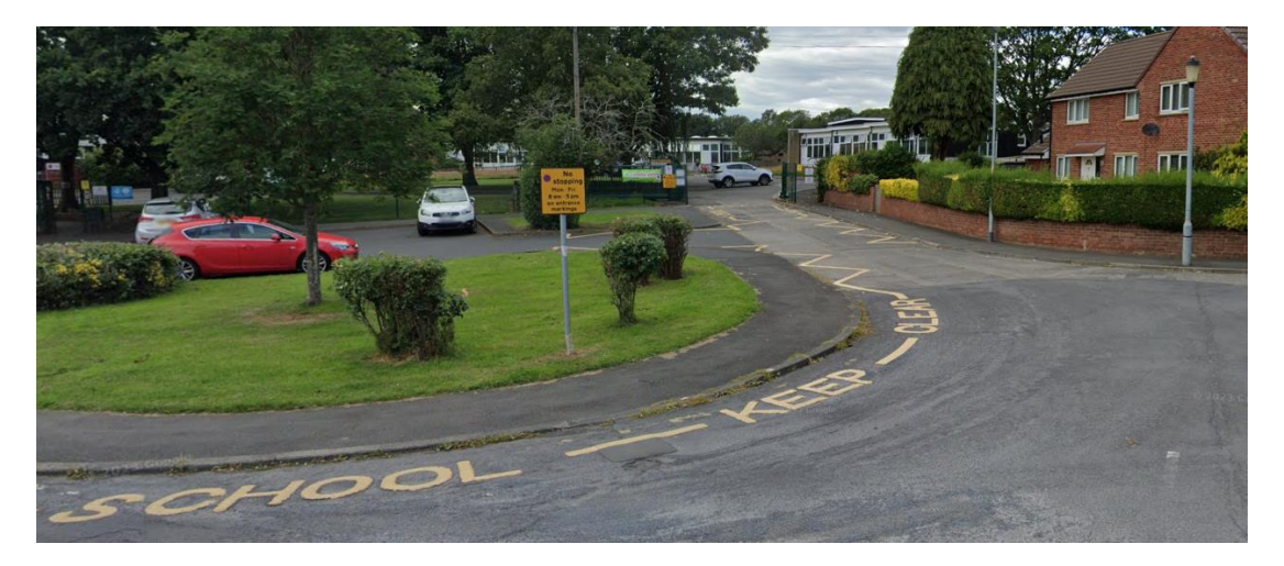
Fig. 1: Existing parking restrictions outside Abbeyfields First School, Morpeth

The area is used as a pick-up and drop-off point by parents accessing the school during peak start and end times, with parking restrictions in the form of 'School Keep Clear' zig-zag markings currently in place to prohibit dangerous parking on Abbots Way at the school entrance.