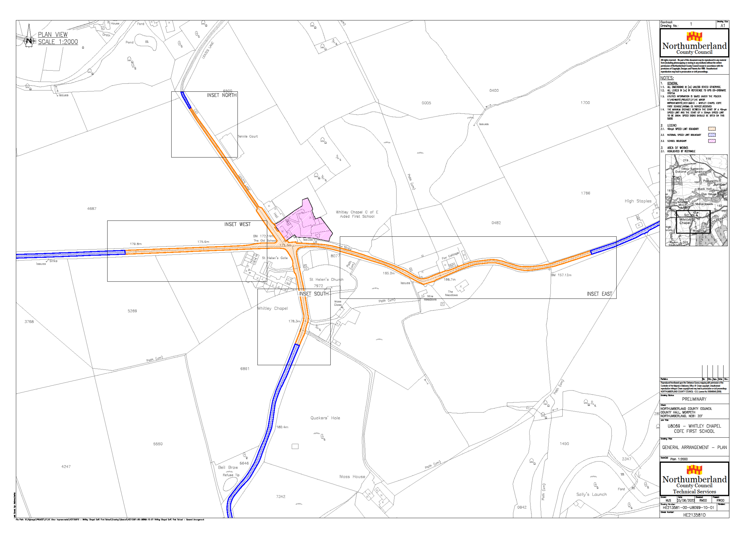
Appendix A - Scheme Plans