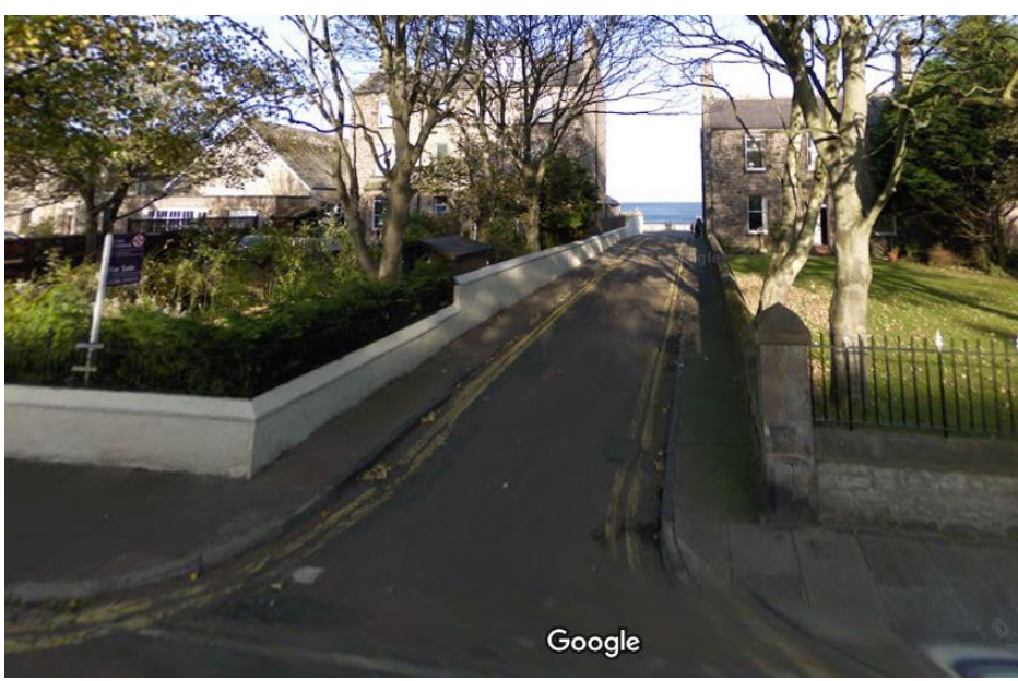
Google images of South Greenwich Road