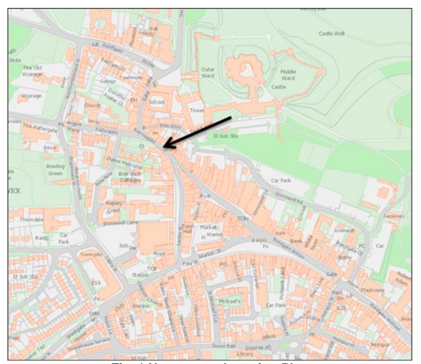
Fig. 1 Narrowgate Location Plan

1. Narrowgate connects Bondgate Within to The Peth/Baillifgate and was part of a 'through route' used by traffic passing through the town centre. Its location is shown in Figure 1.