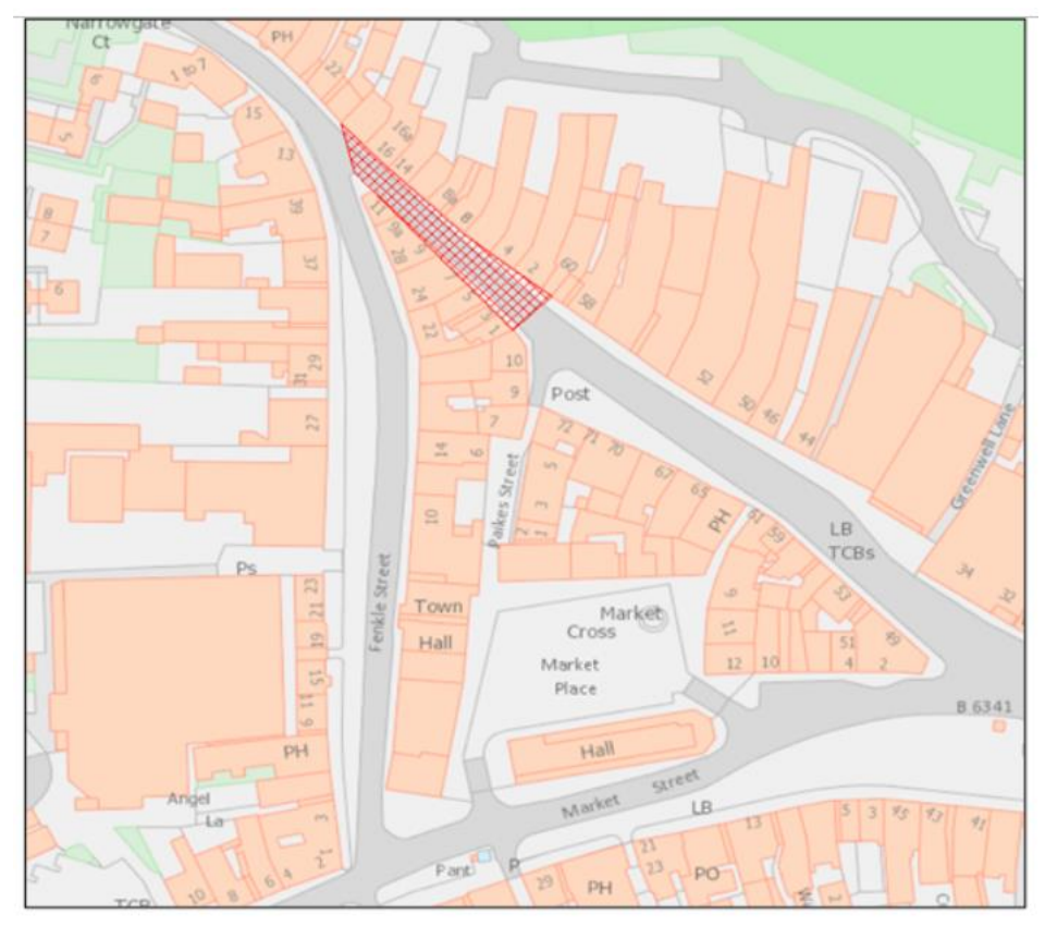
Fig.2 Area of Trial Closure