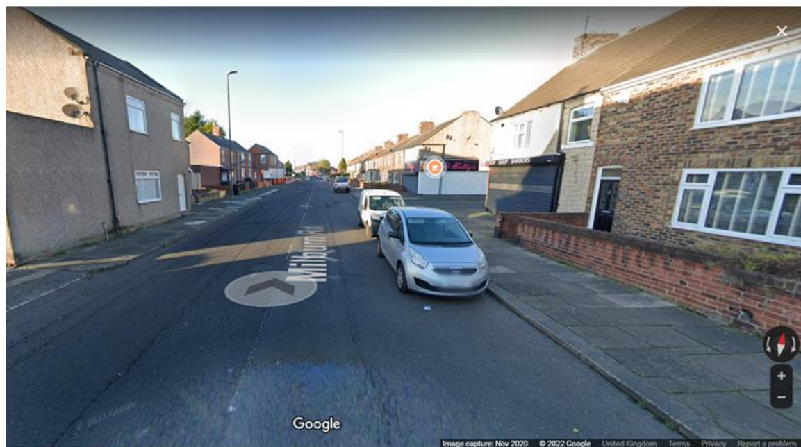
Google image of Milburn Road / Eighth Avenue junction