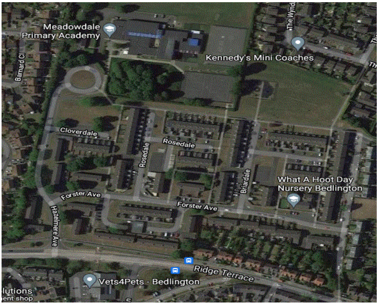
Satellite Location View of Meadowdale Academy and Surrounding Estate

Full scheme details are set out in Appendix B – Scheme Plan