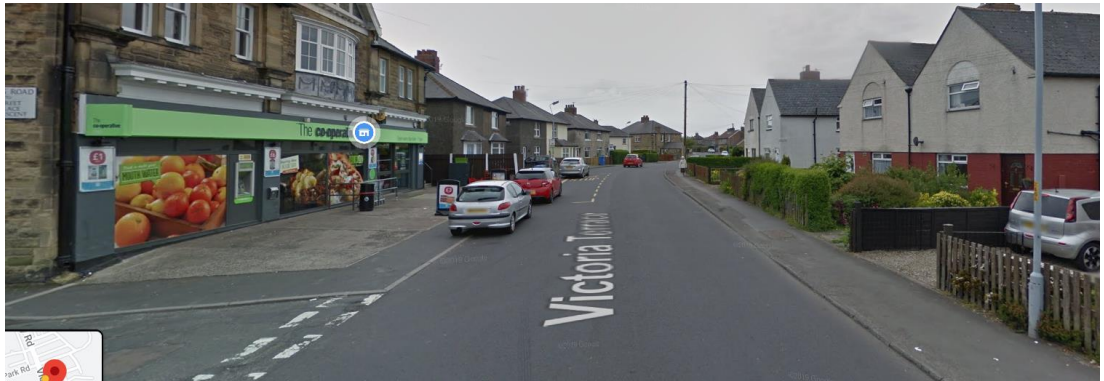
Fig 1: Existing road layout at Victoria Terrace directly outside the Co-Op

The U3129 Victoria Terrace is single carriageway subject to a 30mph speed limit, and is illuminated by street lighting at the general location of the scheme. A Co-Operative Food store operates along this stretch of road at its junction with Queens Road and is therefore a busy point for pedestrians crossing over Victoria Terrace, however no formal arrangements are in place to facilitate this, as is shown by the current layout demonstrated in Figure 1.