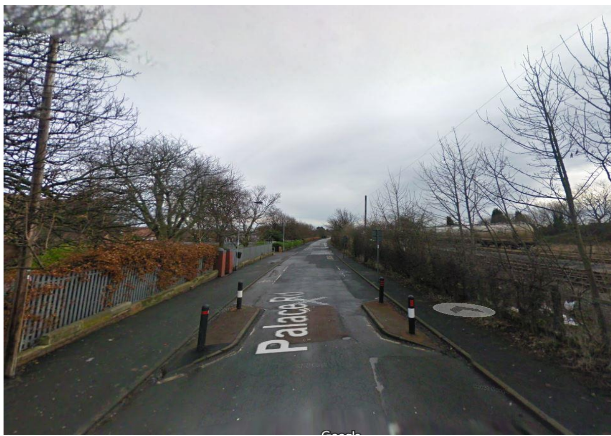
Palace Road southbound adjacent to Bedlington Academy

A Traffic Regulation Order (TRO) will be drafted and implemented as part of this requirement and enforcement will be carried out by NCC Parking Services. The parking restrictions will be enforceable Monday to Friday 8am to 5pm.