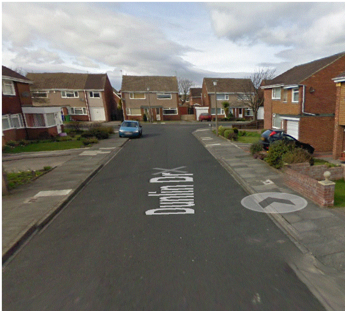
Dunlin Drive – Northbound to the junction with Plover Close