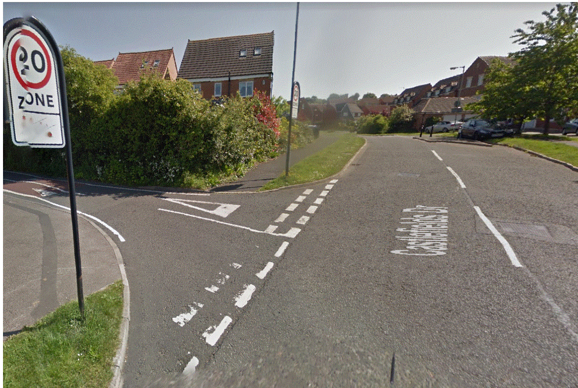
The junction of Castlefields Drive and Broomhouse Lane – Leading to Adderlane First School