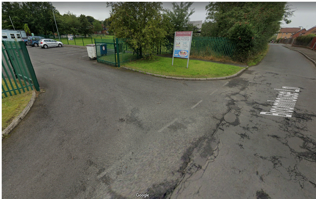
Entrance to Adderlane First School off Broomhouse Lane

The introduction of the speed limit changes in the Castlefield Drive Area of Prudhoe forms part of the 2020/21 Local Transport Plan. This is part of the County Council's road safety initiative to introduce 20 MPH speed limits adjacent to all schools in Northumberland provided it is feasible to do so. Anecdotal evidence suggests that measures of this kind adjacent to schools provide a safer environment for all road users.