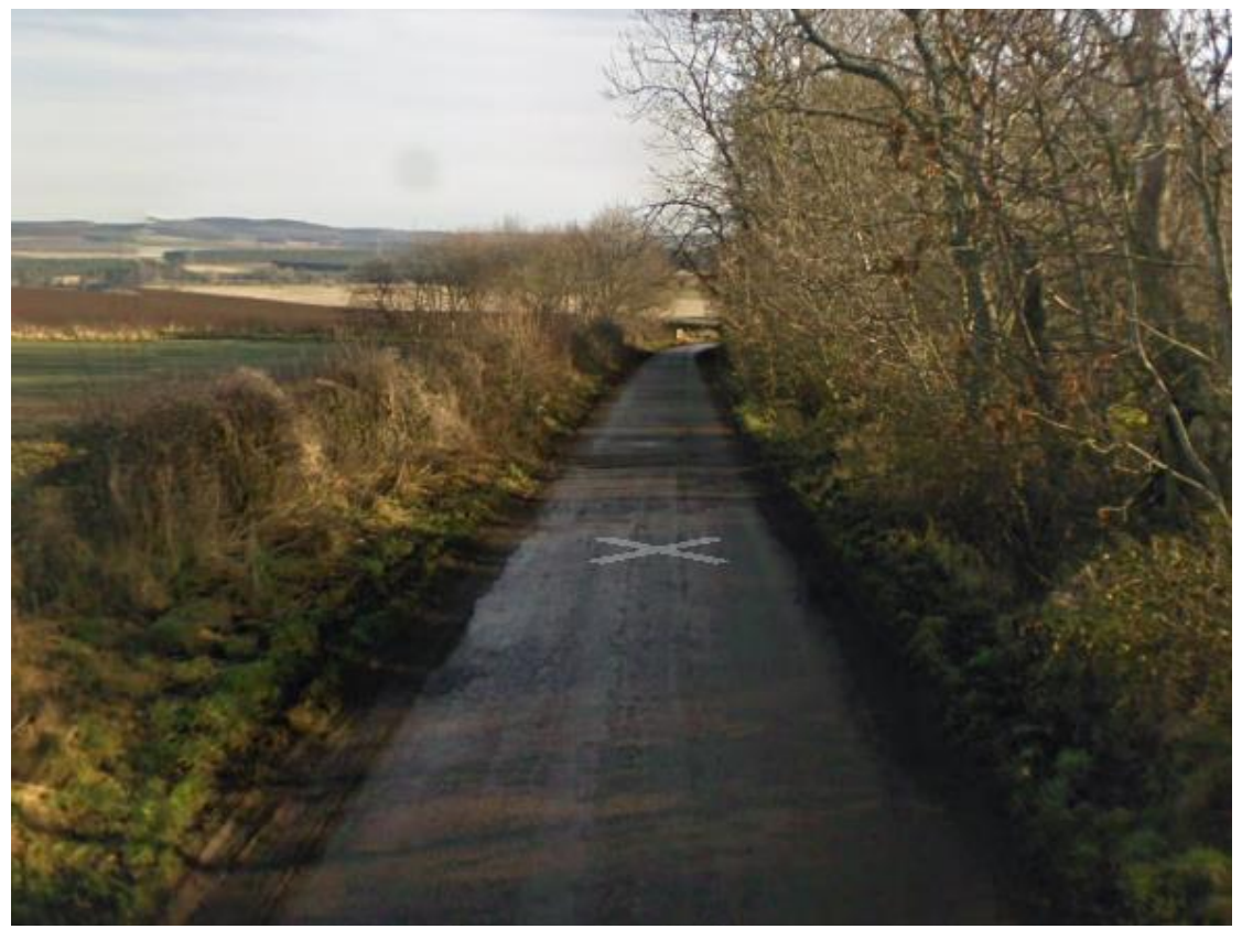
Fig.3. A section of the road west of Milfield Hill, looking south east.

4. Residents have highlighted several issues including: