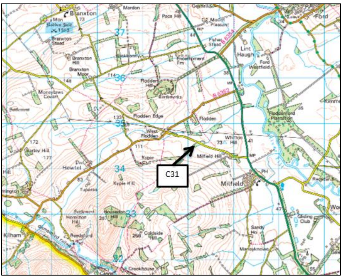
Fig.1. Location Plan.

3. The road varies in width between 3 and 4 metres (approximate). There are no formal passing places. Passing is possible informally using field entrances at certain locations. Figures 2 and 3 show general views along the road.