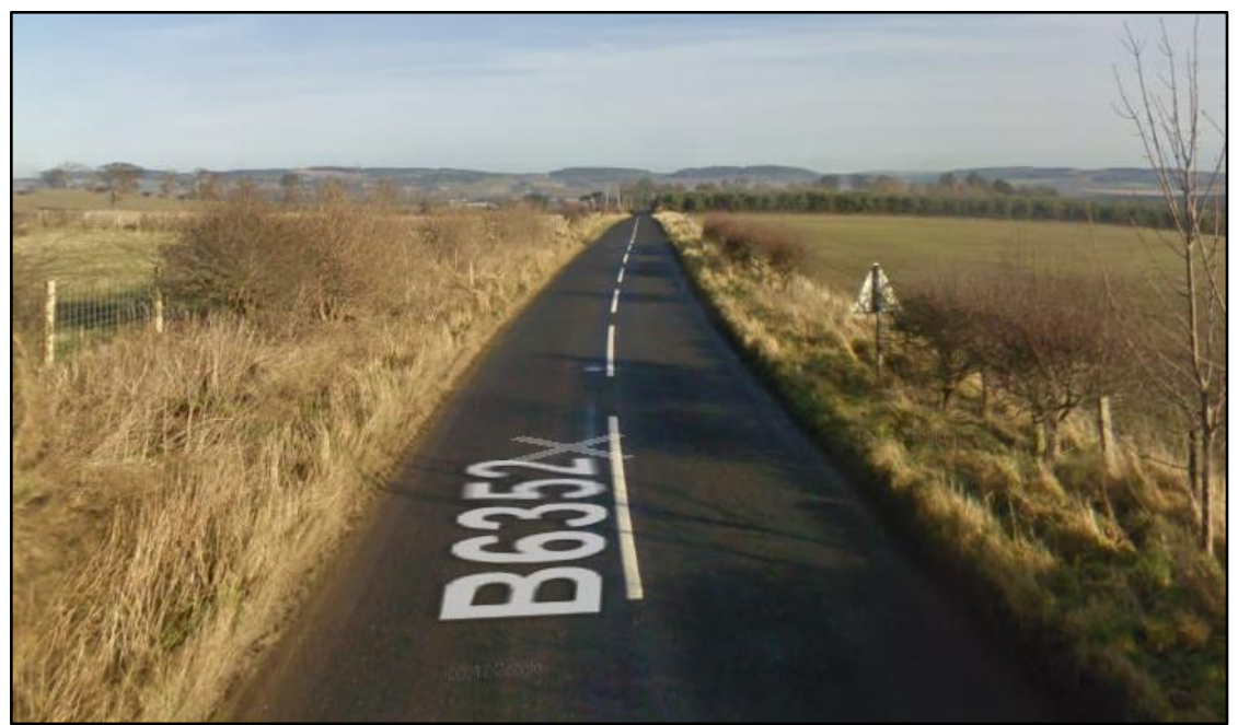
Fig.4. Looking north east along the B6352

5. The alternative route for HGVs is via the B6352 which joins the A697 north of the C31. This road is suitable for HGV traffic and is an agreed timber transport route. A view of the road is shown in Figure 4.