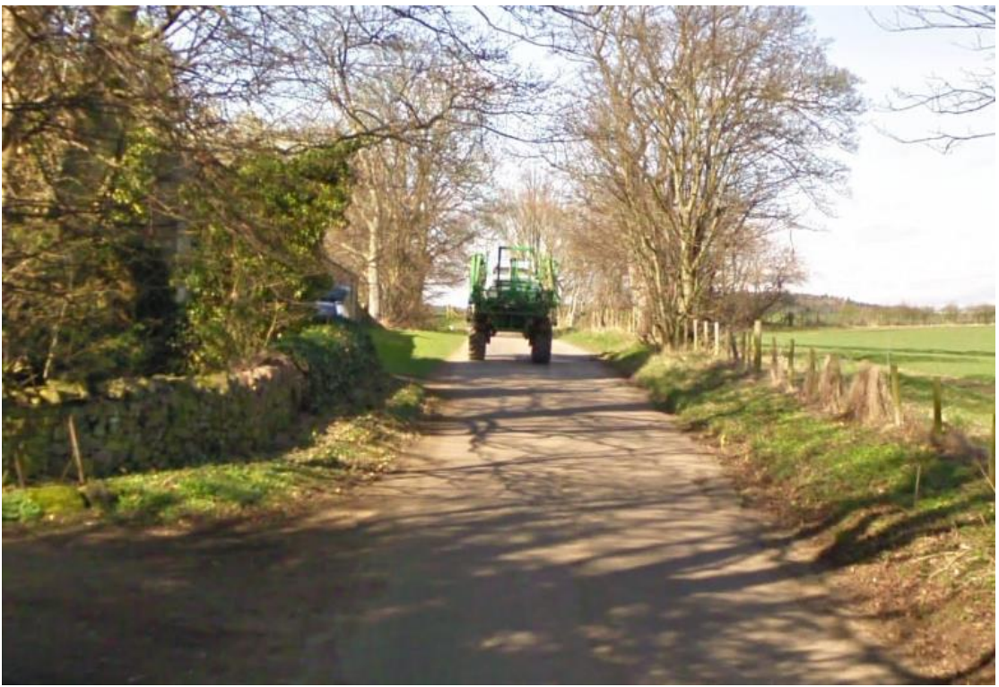
Fig.2. Looking north west at Milfield Hill