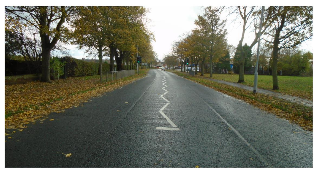
Figure 2 – Existing layout of North Seaton Road, Ashington (southbound approaching Newbiggin Road)