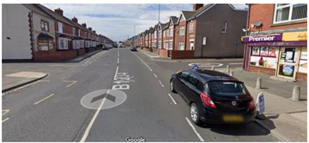
Figure 4 - B1334 Newbiggin Road Junction, Ashington (in vicinity of School Crossing Patrol Site where build outs are to be provided)