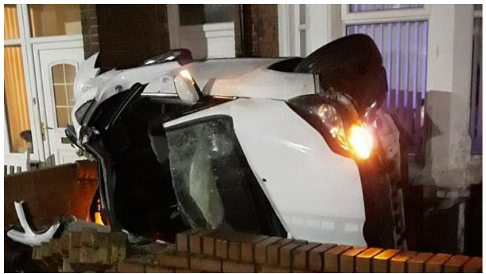
Figure 1 – Aftermath of Accident

In September 2019 a serious road traffic accident occurred when a car travelling south on North Seaton Road at excessive speed failed to slow down for the existing roundabout. The car is reported to have collided with the roundabout and street lighting column, causing the vehicle to "take off" before landing in the front garden of an adjacent property.