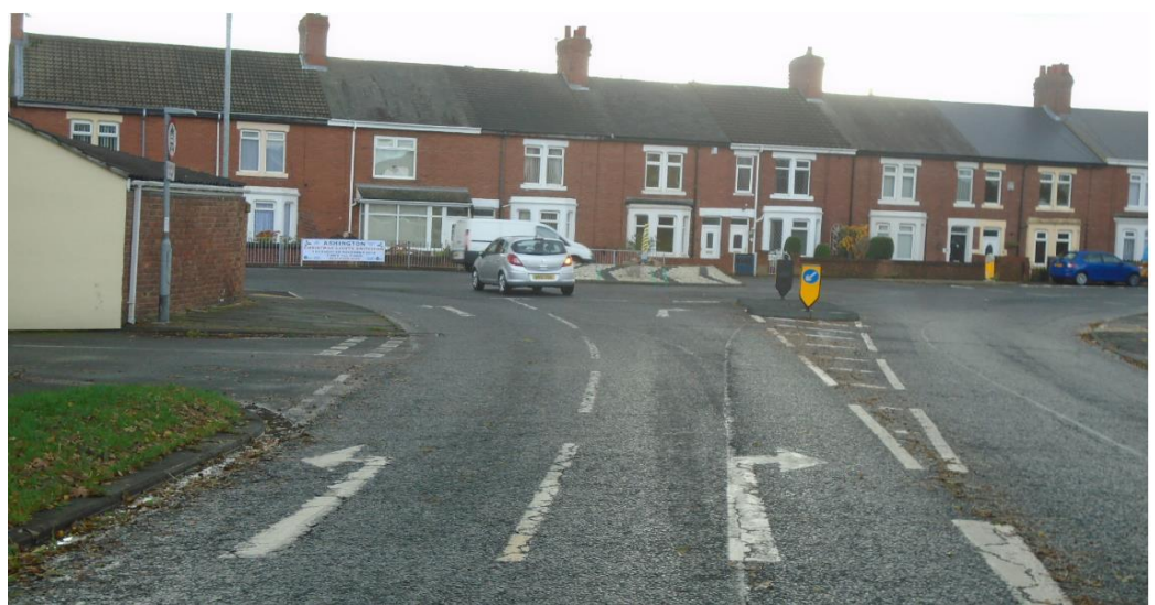
Figure 3 - A196 North Seaton Road/B1334 Newbiggin Road Junction, Ashington