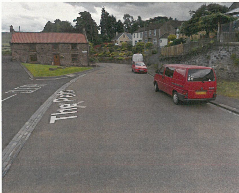
Photograph 1: View showing the approximate location of the proposed restrictions on The Peth in Wooler

It is therefore recommended to introduce 'No Waiting at Any Time' restrictions (double yellow lines) on road safety grounds at this location. The rationale is to prevent parking where it is considered unsafe to do so in key locations. Civil Enforcement will be carried out by Parking Services on their routine visits to the town.