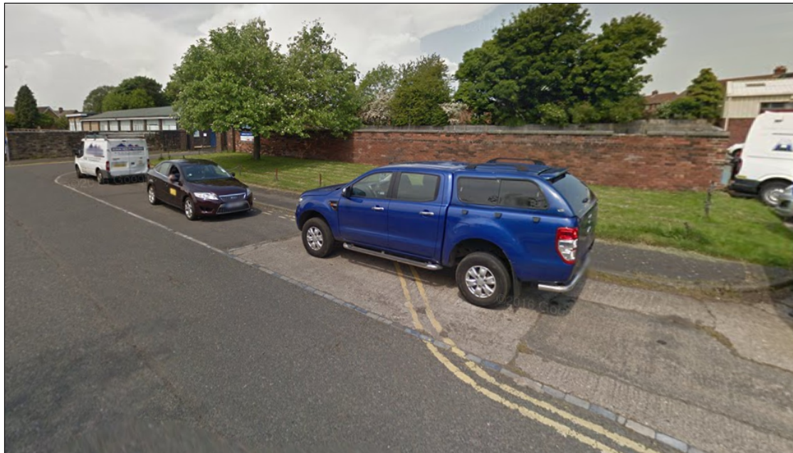
Fig.2. Photo of the layby (prior to removal of the double yellow lines).