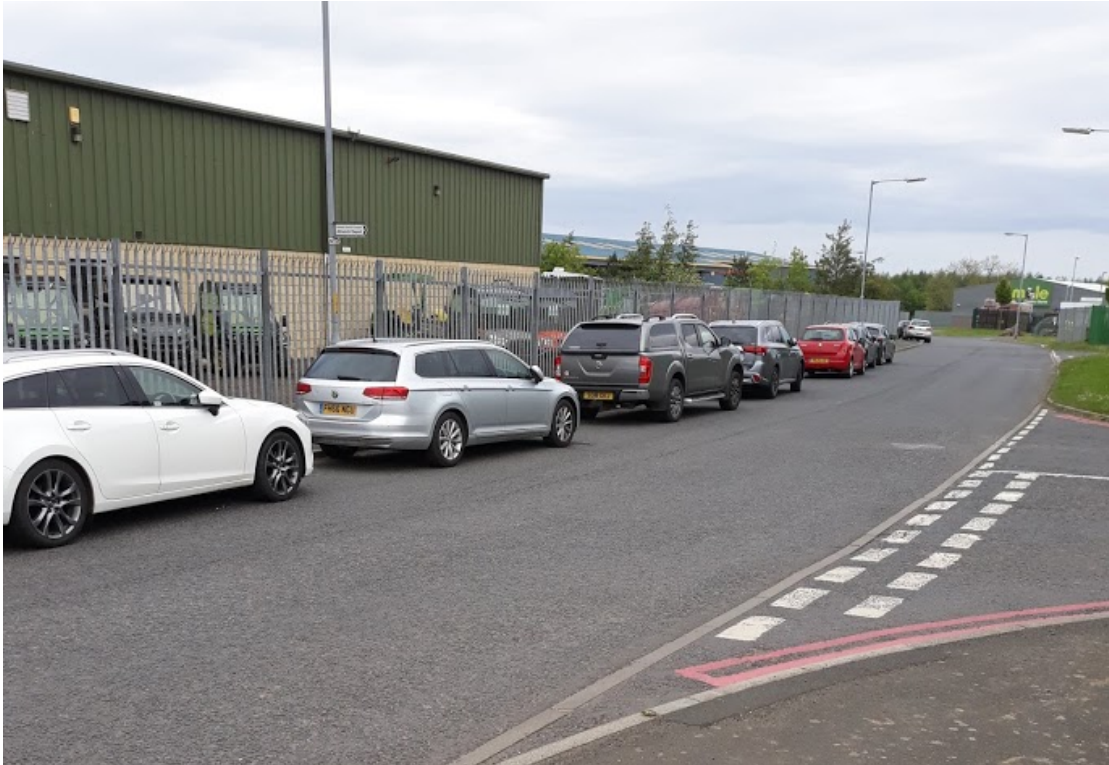
Photo 1. Roadside parking in Oak Drive. Note the existing double red lines on Blackthorn Close.

force the HGVs to wait in the middle of the road, impeding egress by fire appliances (photo 3).