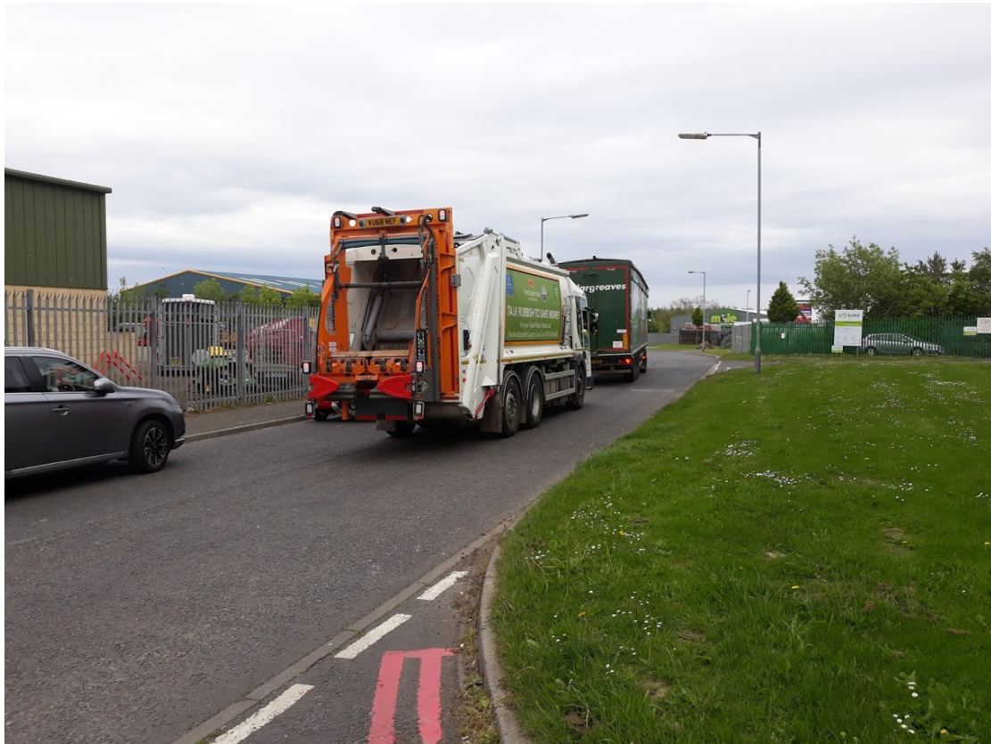
Photo 3. HGVs waiting for access to the waste disposal site forced into the middle of the road by parked cars.