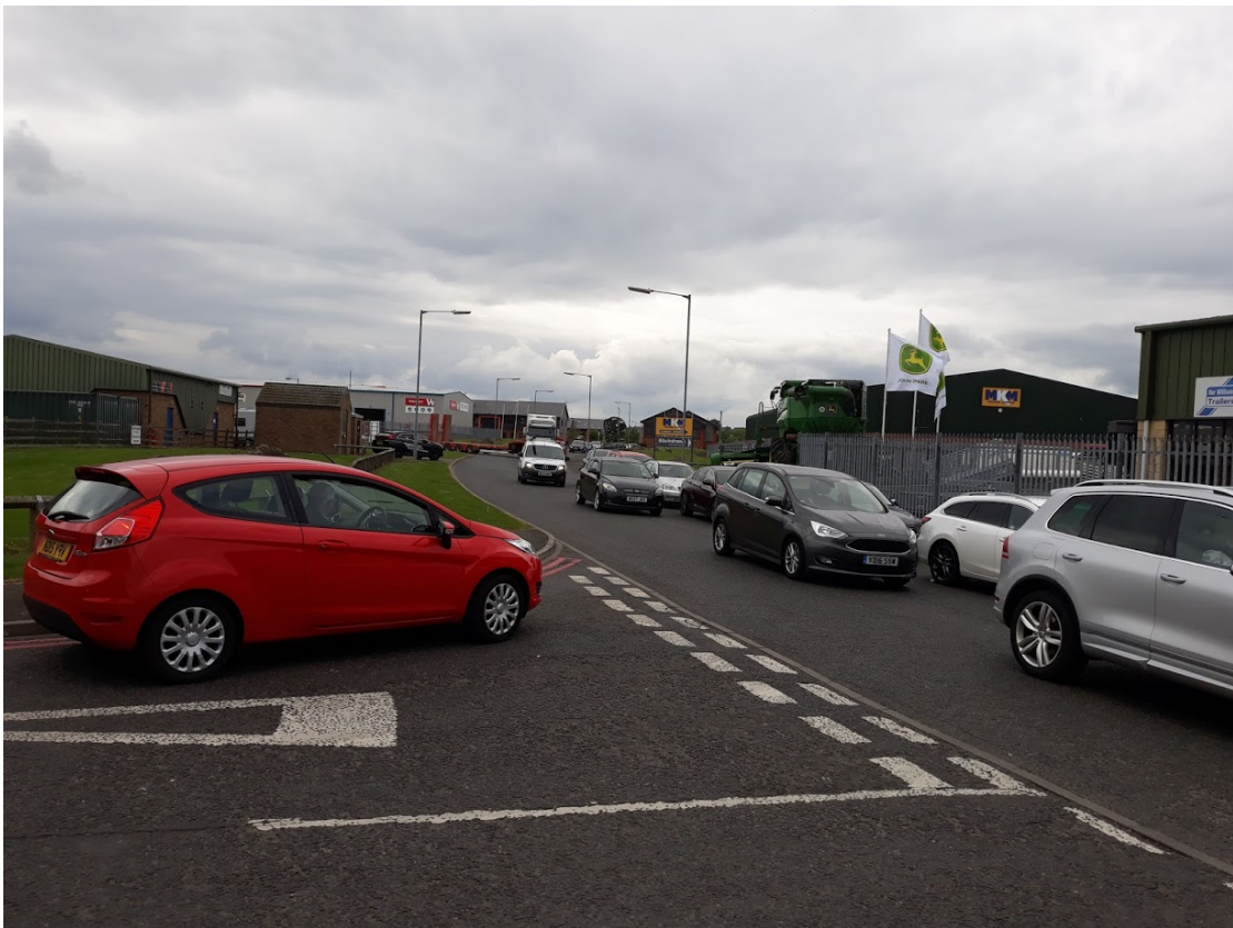
Photo 2. Congestion on Oak Drive (looking south from Blackthorn Close).