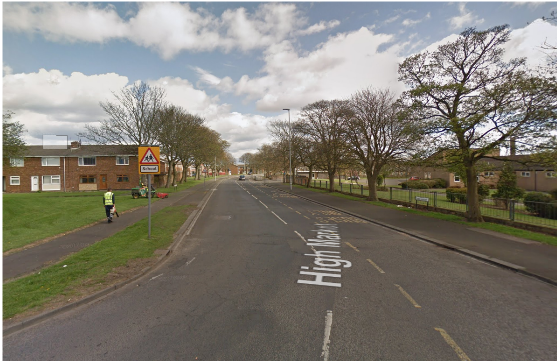
Heading east along High Market approaching Bothal Primary School