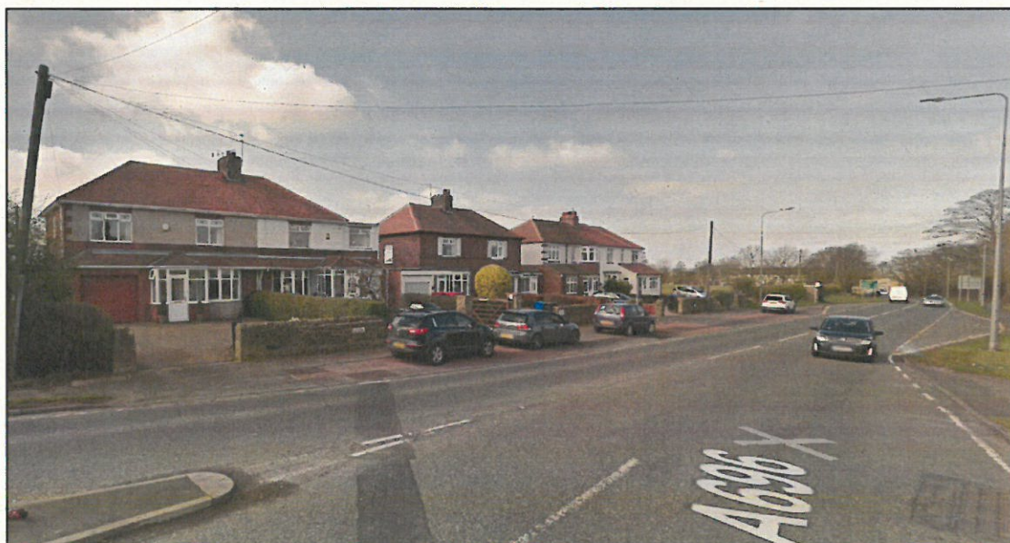
Fig. 2. Photograph showing Parking Area