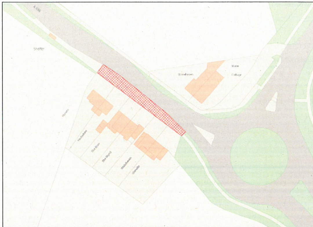
Proposed Residents Permit Parking, Prestwick Road Ends