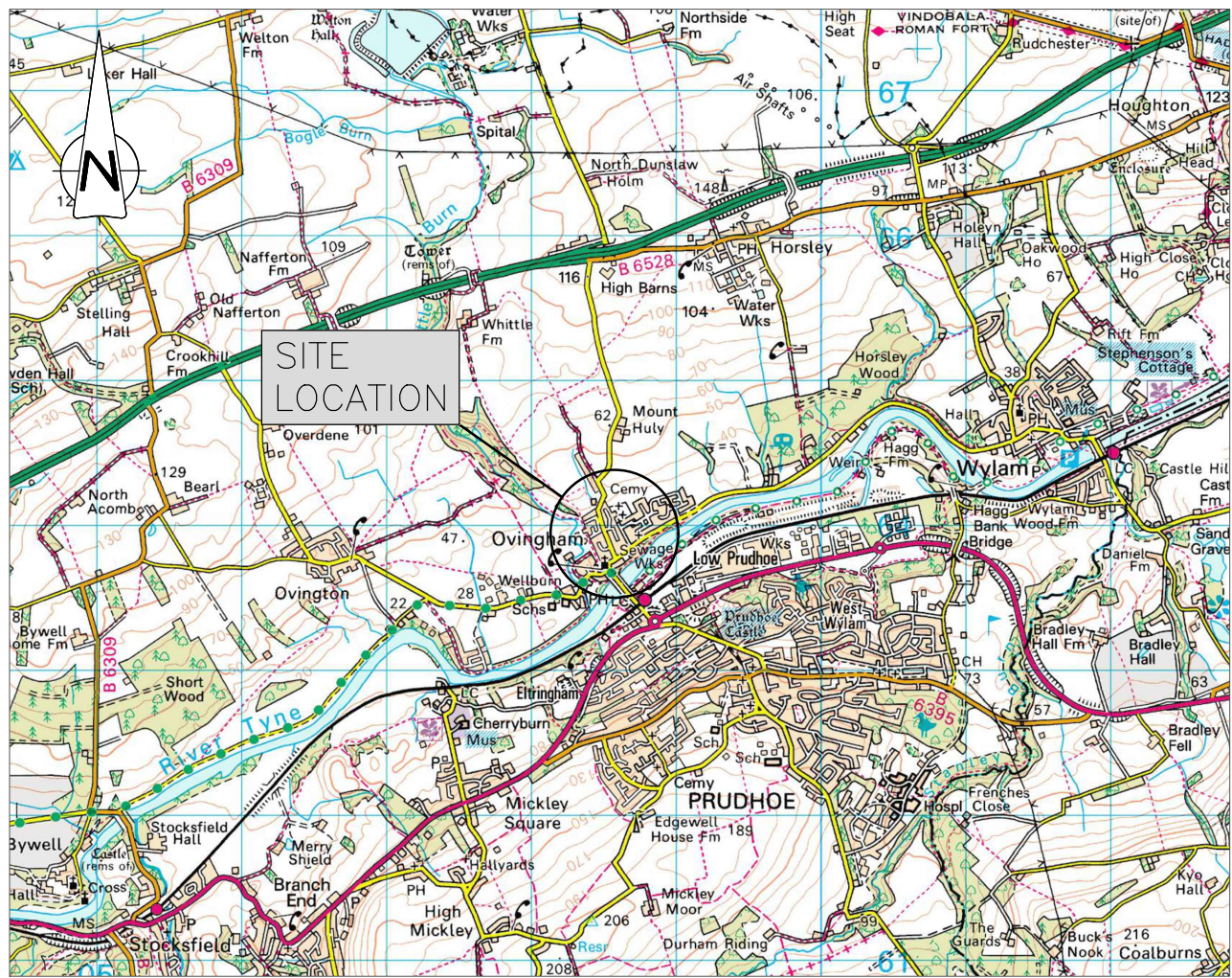
LOCATION PLAN Scale 1/50,000