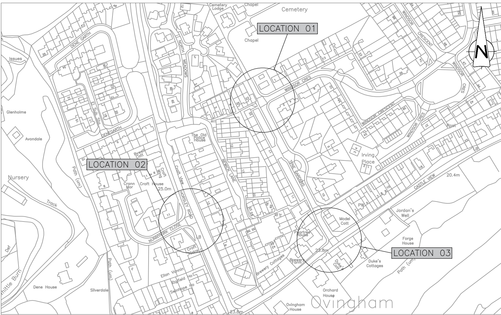
SITE PLAN Scale 1/2500