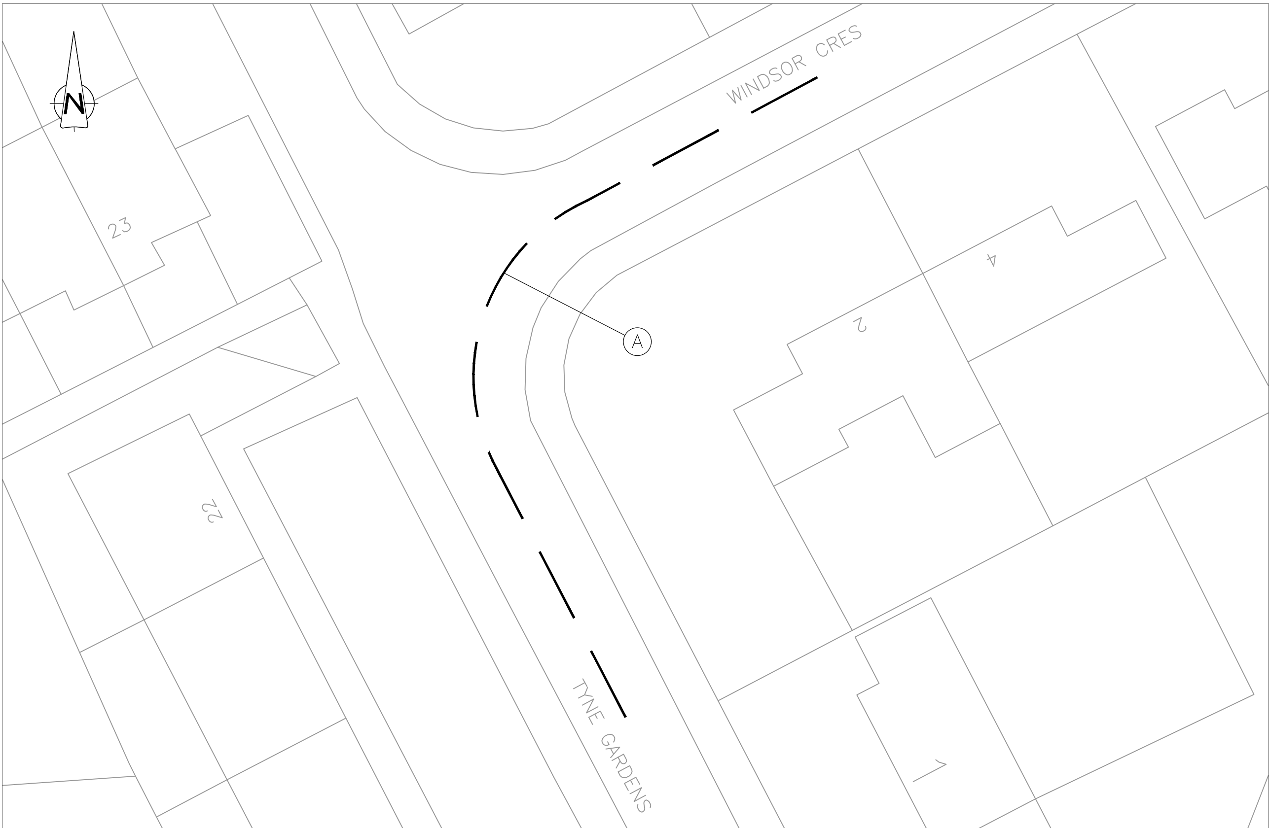
LOCATION 01 - WINDSOR CRESCENT / TYNE GARDENS Scale 1/200