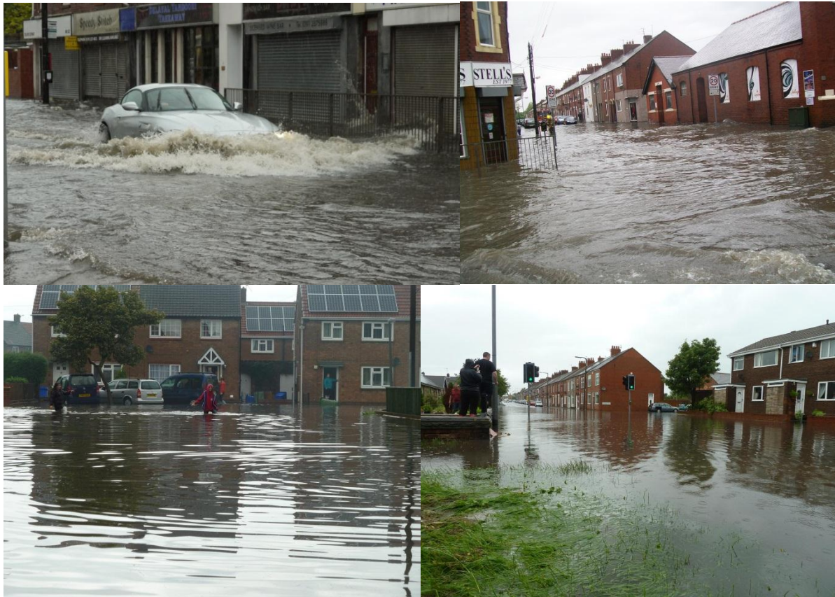
Photos of flooding in Seaton Delaval. Top two photos are flooding on Avenue Road; the bottom two portray flooding within residential areas.