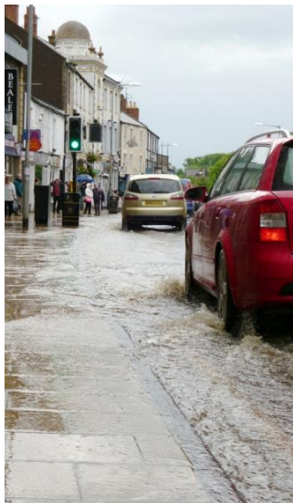
Plate 1: Flooding from Hexham High Street