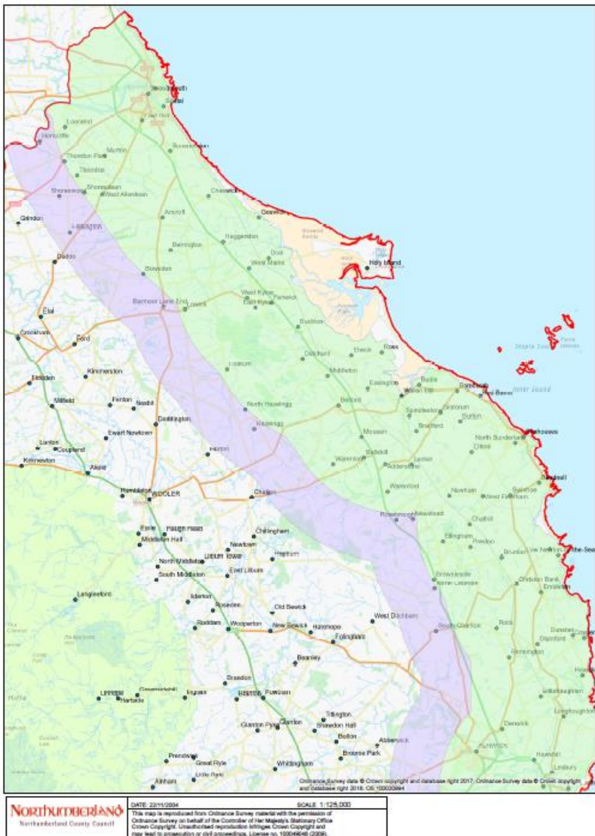
Figure 2: Coastal Zone of Influence (North)