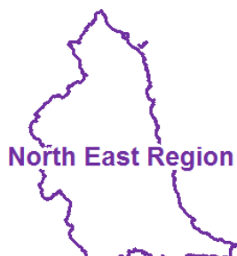
North East Region