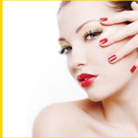
COMMERCE AND ENTERPRISE