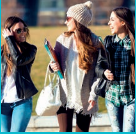
BE ABLE TO GET AHEAD