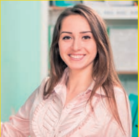
HEALTH, CARE AND EDUCATION