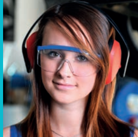
EARNING AND LEARNING