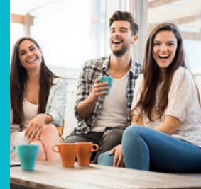
I WANT TO LEARN, WHERE AND WHEN CAN I DO IT?