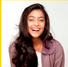
PREPARING FOR HIGHER EDUCATION