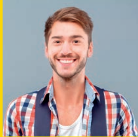
HUMANITIES AND SCIENCE