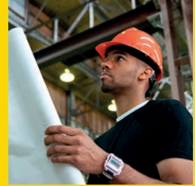
CONSTRUCTION AND ENGINEERING