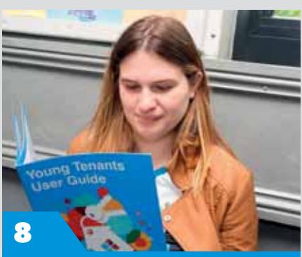
YOUNG TENANTS' GUIDE LAUNCHED