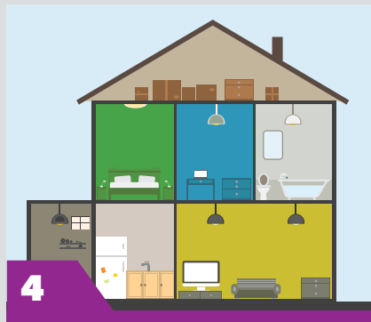
MAKING IMPROVEMENTS TO YOUR HOME