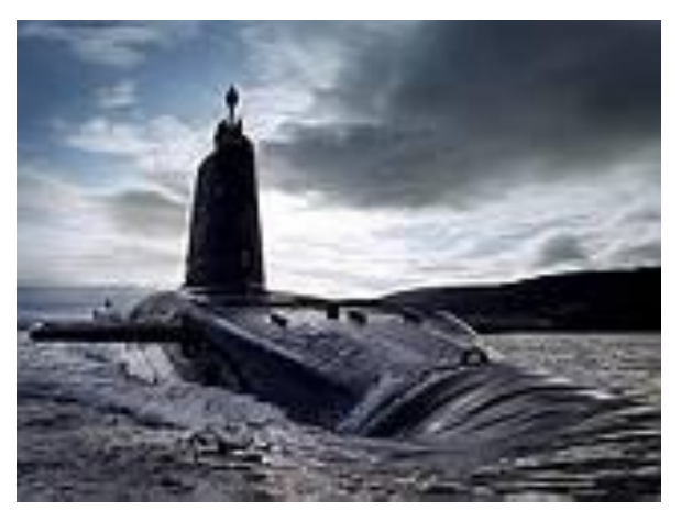
HMS Victorious in the Clyde estuary in transit to HM Naval Base Clyde

1.5 The response by the emergency services and local authorities to a transport emergency involving DNM will have much in common with the response to any major incident or emergency. The Police provide strategic direction of any multi-agency response through the Strategic Co-ordinating Group (SCG). The principles laid down in the Cabinet Office publication "Emergency Response and Recovery" and the Scottish Government publication "Preparing Scotland" form the basis of MOD's own arrangements which are fully integrated into the overall response.