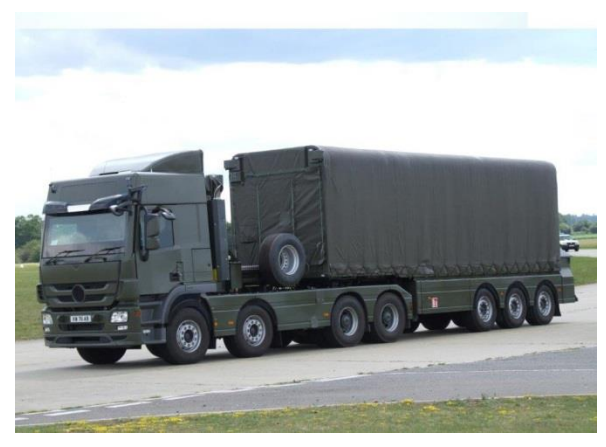
TCHD Mark 3

first aid team and personnel equipped to monitor for radiological hazards.