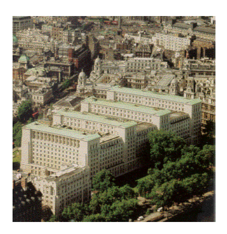
Ministry of Defence Head Office

5.9 A diagram showing the relationship between the HQ DNEO, wider MOD forces, local organisations and the Central Government Organisation is at Annex D.