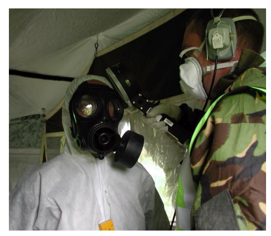
Personal Protective Equipment as worn by military personnel