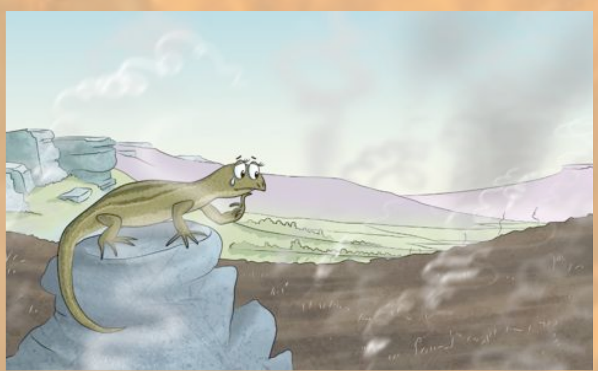
Lizzie the Lizard, from the Peak District wildfire app

BogFest is set to be a unique conference with a festival atmosphere, set in the heart of the beautiful Peak District National Park and hosted jointly by the Moors for the Future Partnership and IUCN UK Peatland Programme. BogFest will provide opportunities to learn about about a range of issues such as peatland science, policy finance, communications and management; natural flood management, protected areas, global peatlands, moorland fringe, biodiversity and cultural ecosystem services. You can find out more about the event and view the draft agenda on the Moors for the Future Partnership website at <a href="http://www.moorsforthefuture.org.uk/bogfest-2017">http://www.moorsforthefuture.org.uk/bogfest-2017</a>