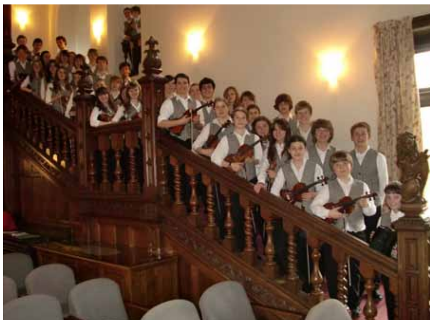
Pictured: Members of the Northumberland Ranters music group.

The trip, which lasted just over a week during the Easter holidays, was paid for through parental contributions as well as the fundraising efforts of the students themselves who ran coffee mornings and arranged sponsored haircuts. The following organisations also supported the trip with donations: Ponteland Town