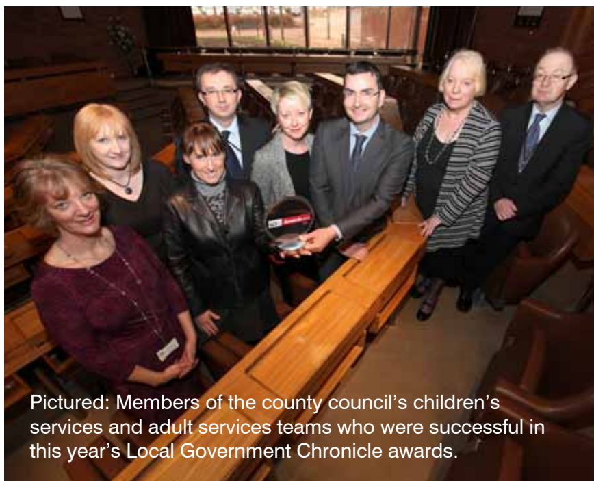
Pictured: Members of the county council's children's services and adult services teams who were successful in this year's Local Government Chronicle awards.