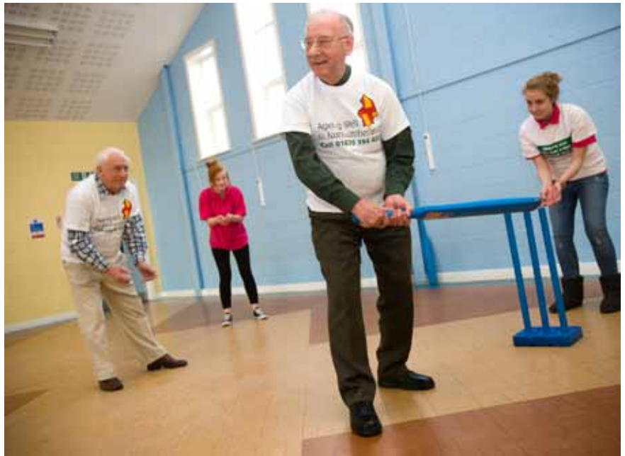
Pictured: One of the Ageing Well programmes in Ashington.

"I got involved in doing activities at Hirst Welfare, where older people and teenagers come together to pass on our experience and swap skills. We've made calendars, willow weaving, played computer games and now we are doing cooking.