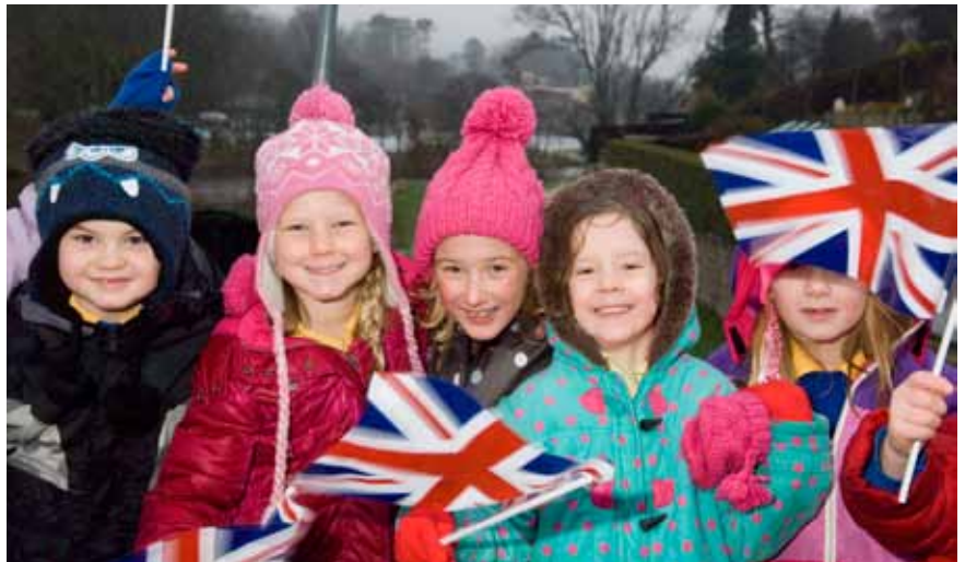
Pictured: Children from Rothbury First School at the official opening of Rothbury Bridge.

The bridge across the River Coquet is within the heart of the community in Rothbury; closing the bridge for any length of time was not feasible, so engineers met the challenge by building a temporary Bailey bridge to carry traffic across the river while the work on the original bridge was completed.