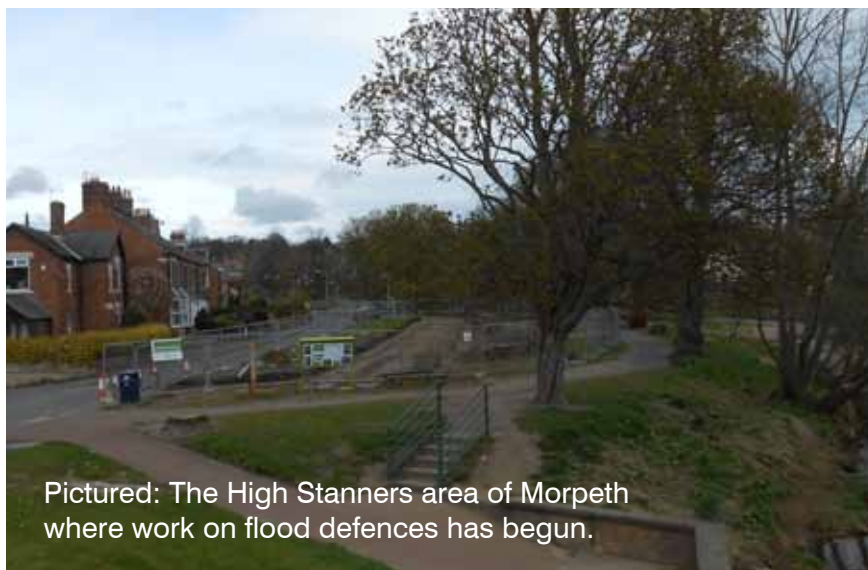
Pictured: The High Stanners area of Morpeth where work on flood defences has begun.

Collingwood oak trees were removed from High Stanners earlier this year to allow the building of the new flood bank and defence walls.