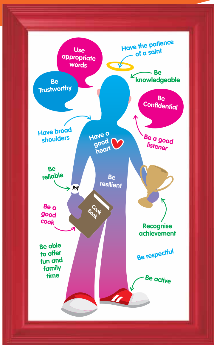
Qualities of a good foster carer from our young people.

*Many agencies only pay a fee when you are caring for a child.