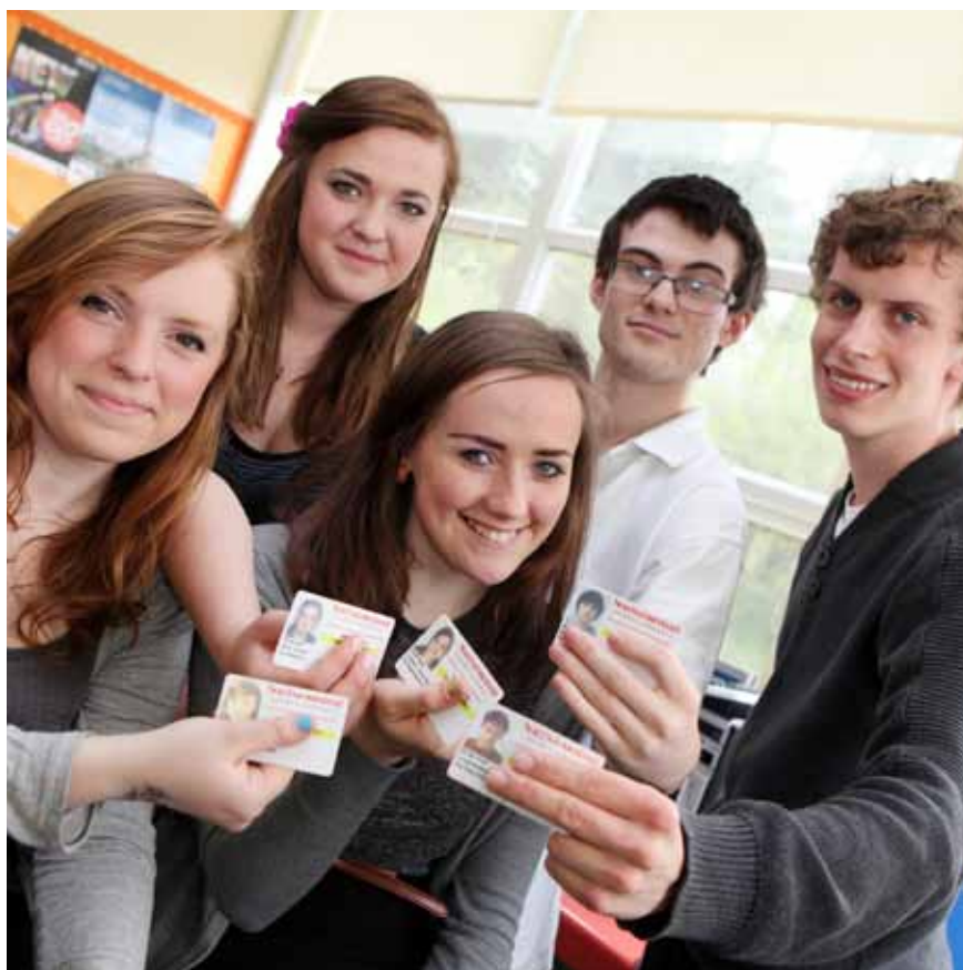
Pictured: Sixth formers at King Edward VI High School, Morpeth with their post-16 travel passes.

Applying for the travel pass online makes the process much more efficient. Students can fill in the form quickly and will be given an e-receipt to let them know their form has been received and how long it will take to process their application.