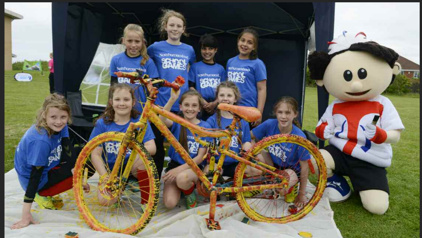
Photo: Pupils at the Northumberland School Games painting a bike.