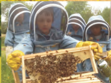
Photo: The Broomley Bee project which enthuses children with the wonders of beekeeping.

To find out more about LOVE Northumberland go to www.northumberland.gov.uk/love