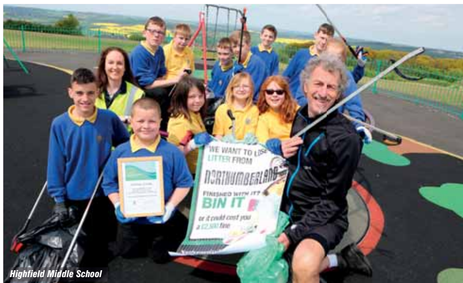
Highfield Middle School