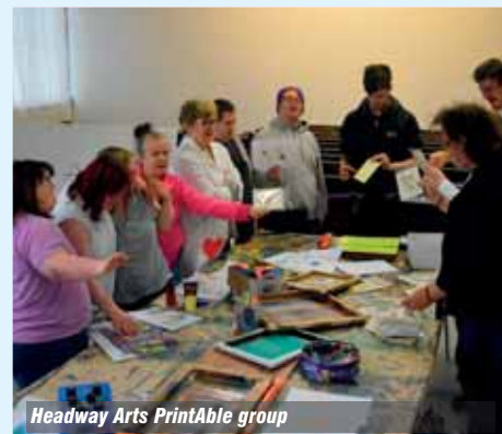
Headway Arts PrintAble group