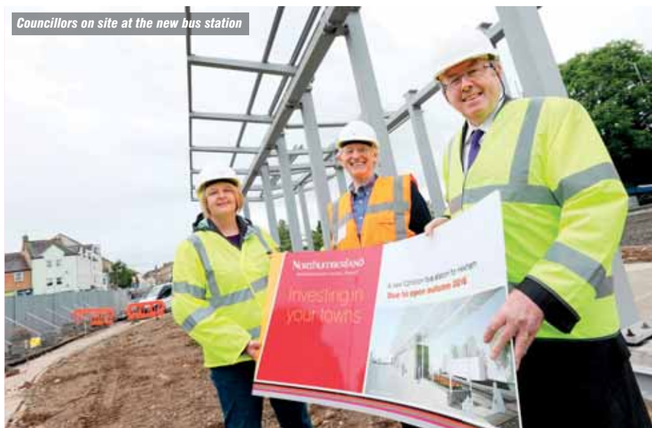
Councillors on site at the new bus station

Work is well underway on a new £2million bus station for Hexham which will provide modern facilities for bus users including an enclosed waiting area, toilets and refreshment facilities.