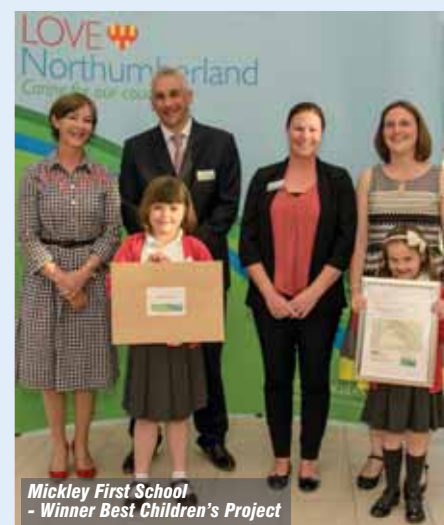
Mickley First School - Winner Best Children's Project

The school was also awarded the Best Children's Project award for their Community Life project where pupils have focused on developing a wider awareness of their community. Pupils