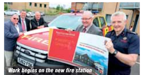
Work begins on the new fire station

Building work is underway on a £2.2 million community fire station at the Hexham General Hospital site.