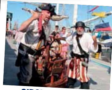
CIRCUS ACTS AND STREET PERFORMERS