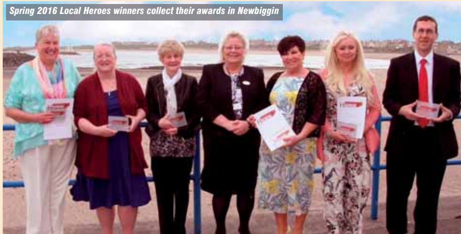
Spring 2016 Local Heroes winners collect their awards in Newbiggin

To find out more about the Local Heroes awards, or to nominate someone for an award visit www.northumberland.gov.uk/heroes