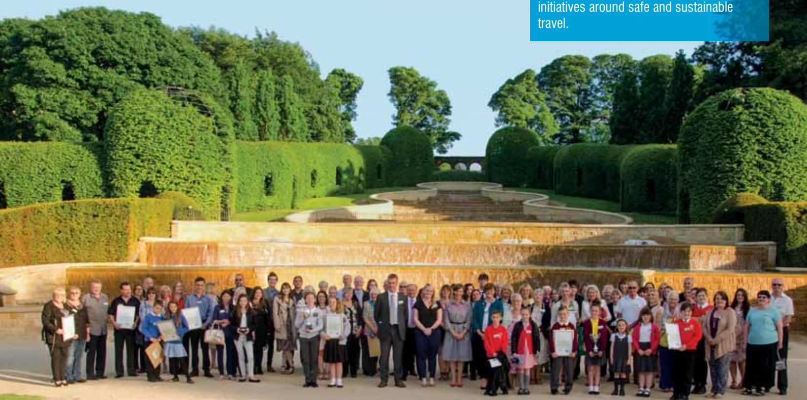
Love Northumberland award winners at Alnwick Garden

The school sustainable travel award was presented by Go Smarter Northumberland to Mickley First School for a range of initiatives around safe and sustainable travel.