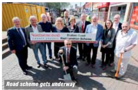
Road scheme gets underway

A six-month project which will see Station Road re-opened to traffic, boost local trade, improve the overall look of the street and help deliver wider economic benefits as part of the ongoing regeneration of the town centre is well underway. A scheme will be launched later this summer to help shop owners improve their shop fronts over the next two years.