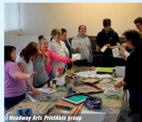
Headway Arts PrintAble group