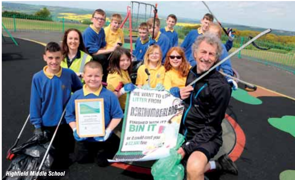
Highfield Middle School