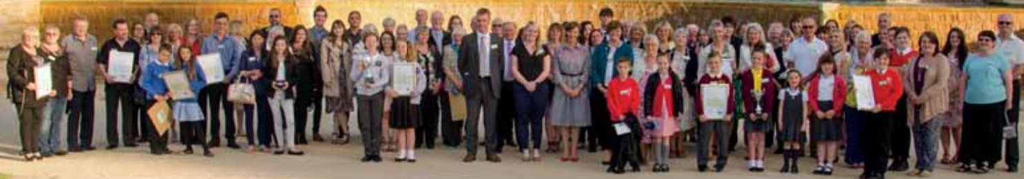
Love Northumberland award winners at Alnwick Garden

The school sustainable travel award was presented by Go Smarter Northumberland to Mickley First School for a range of initiatives around safe and sustainable travel.