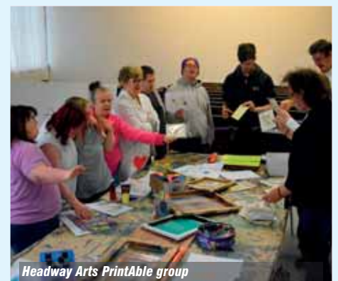
Headway Arts PrintAble group