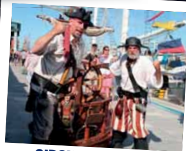
CIRCUS ACTS AND STREET PERFORMERS