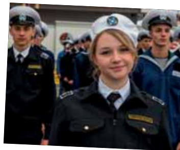
MEET THE CREWS FROM AROUND THE WORLD