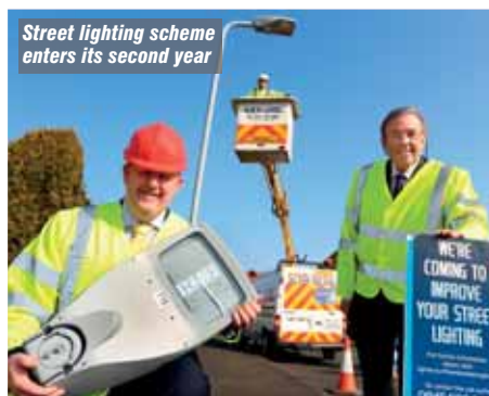
Street lighting scheme enters its second year

The £23m street lighting modernisation project has already seen almost 5,000 lights replaced and over 3,500 new lamp-posts installed, which are using two thirds less energy than the old conventional lights. The project will create a 64% energy saving and net savings of nearly £300,000 a year.