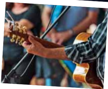
LISTEN TO LOCAL MUSIC