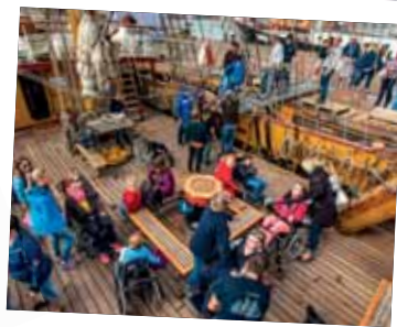
BOARD THE TALL SHIPS