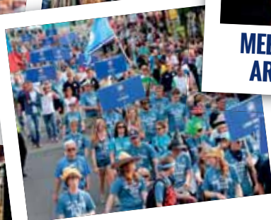
SEE THE PARADE