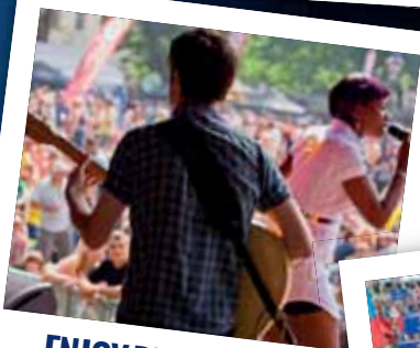
ENJOY BIG BANDS ON THE MAIN STAGE