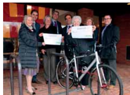
Members of the Northumberland cycling and walking board

The strategy is outlined in Geared Up, a new prospectus drawn up by members of the Northumberland Cycling and Walking Board including Northumberland County Council, Active Northumberland, Sustrans, Kielder Water and Forest Park, Northumberland National Park, Northumberland Tourism, and the Northumberland Clinical Commissioning Group, with support from Natural England.