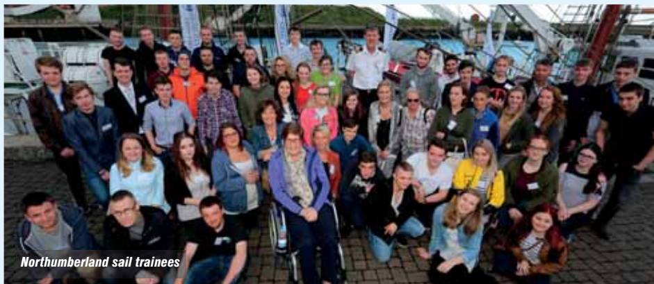
Northumberland sail trainees

80 people between the ages of 15 and 63, have been recruited as sail trainees and will sail on board the Tall Ships during their race to Gothenburg, Sweden. Most come from Northumberland and many of our ward councillors are supporting them.