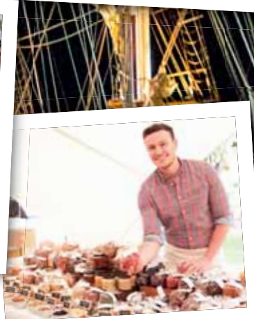
LOCAL FOOD AND DRINK